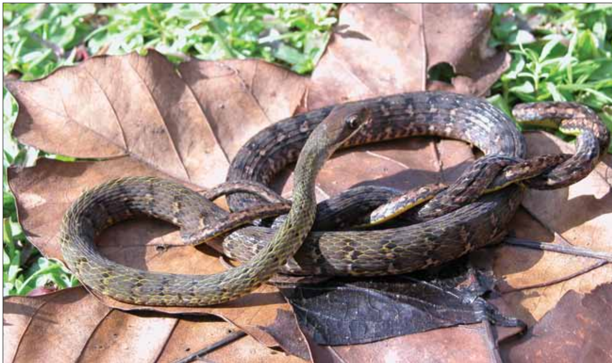
Figure 2. Dendrophidion dendrophis (MPEG 21140, Monte Dourado, Pará, Brazil) with tightly twisted tail and posterior part of body, just before autotomizing part of the tail.

The material was collected under collecting permits of the Ministério do Meio Ambiente issued by the Instituto Brasileiro do Meio Ambiente e dos Recursos Naturais Renováveis (IBAMA) (MMA-IBAMA, license numbers 043/2004-COMON, 0079/2004-CGFAU/LIC, 127/2005 and 048/2005).